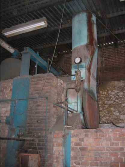
Photo 1: The boiler at HUATUSCO's mill, converted from a fuel mix of diesel and rice husk to coffee husk