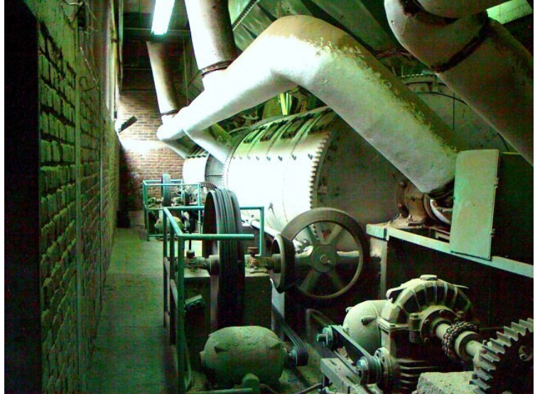
Photo 2: Rotating green coffee dryers supplied with hot air source from boilers powered by coffee husks.