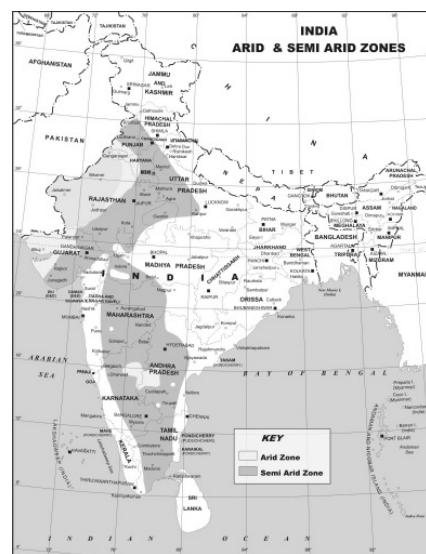
Figure 3: Arid and semi arid zones in India

Finally, COMPETE activities in the field of international cooperation also include the promotion of knowledge transfer and joint ventures on modern bioenergy technologies for applications in African countries [20].