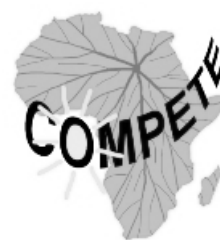
Figure 1: COMPETE logo