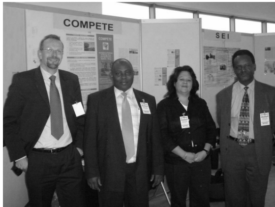
Figure 4: COMPETE Participants at The First High-level Biofuels Seminar in Africa

Based on the plenary and thematic sessions and Ministerial Roundtable discussions of the First High-level Biofuels Seminar in Africa, the seminar participants agreed upon a set of recommendations laid down in The Addis Ababa Declaration on Sustainable Biofuels Development in Africa [25].