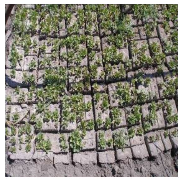
Chapin with seedlings

During the dry season the chinampas are irrigated with lake water. The mild winters allow continuous cropping throughout the year, land use intensity is increased by producing crop seedlings in a small plot and transplanting. The seedlings are grown, by preparing a seed bed, consisting of a 5 cm layer of mud exposed to the sun to dry. When it is almost dry, it is cut in squares 5 cm wide and long. A seed is planted in the center of each block, called chapin, the seedling develops during the initial phase of the crop to be transplanted later.