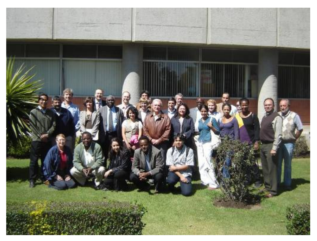
Participants of the COMPETE Seminar in Mexico